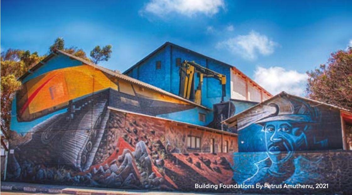
Building Foundations by Petrus Amuthenu, 2021

Above: Petrus Amuthenu "Jero" chose the complicated south-facing walls of the Oranjemund Little Theatre to paint a large industrial themed mural using traditional graffiti spray-paint techniques. The mural depicts an open-cast mining scene, including a miner and a gigantic excavator digging into the earth. With this image Petrus celebrates the men and women who operate large machinery and are the foundation upon which all the diamond mining operations in Oranjemund are built. Without their dedication and courage, it would be impossible to create the prosperity on which the town depends.