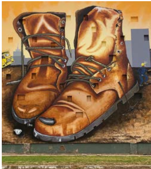
Safety Always by Frans Uunona

Right: Artist Frans Uunona chose to create Safety Always, a mural measuring 15 x 9 meters in the center of Oranjemund, well known for its desert diamond mining activities.