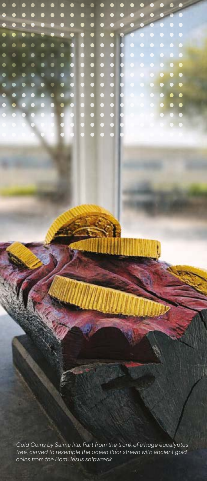
Gold Coins by Saima Iita. Part from the trunk of a huge eucalyptus tree, carved to resemble the ocean floor strewn with ancient gold coins from the Bom Jesus shipwreck